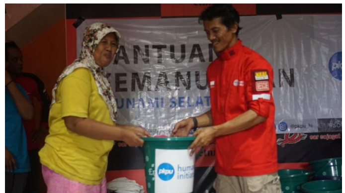
Distribusi Hygiene Kit di Pengungsian Radio Krakatau, Jl. ahmad yani, Labuan, Pandeglang