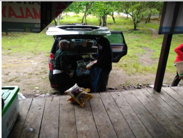
Persiapan Distribusi Logistik di Pos PKPU