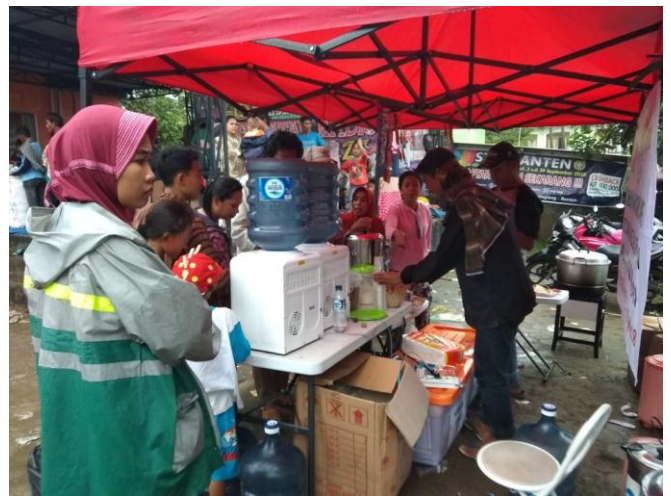
Dapur air di Pengungsian Radio Krakatau, Jl. ahmad yani, Labuan, Pandeglang