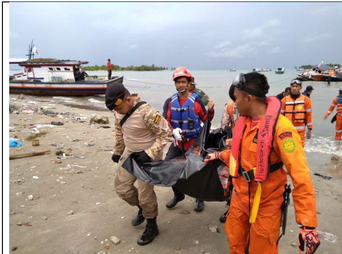
Evakuasi ditemukan di Pulau OE, Desa Sumber Jaya, kec. Sumur